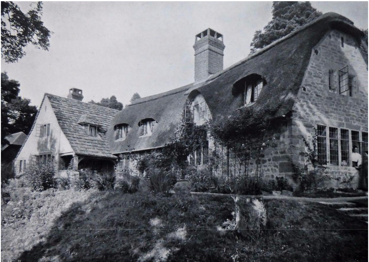
Long Copse House c.1899 designed by Alfred Powell